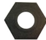
10 lb. or 16 lb. base