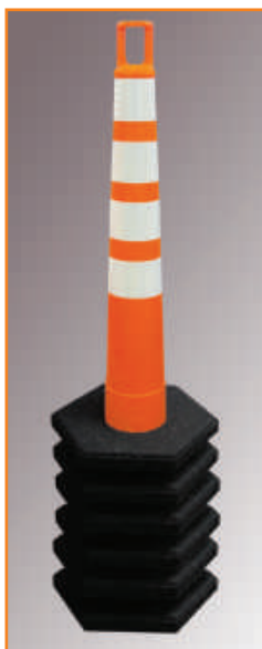
Compact stacking, even with base attached