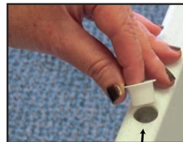
Sand Fill Hole

Each sign frame has two fill holes, one on each half of the frame.