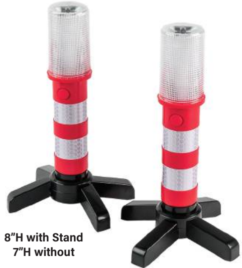
8" H with Stand 7" H without