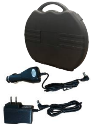
AC charger input 100 V - 240 V output 5.5 V, 400 mAh