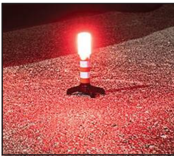
3 Modes 1. Red Flash 2. Red Solid 3. White Solid