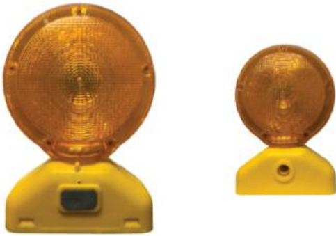
Double Side Lens - Type A/C Amber Lens Function: Steady-Flash-Close Requires 4 D-Cell Batteries SLB-AB-410KA