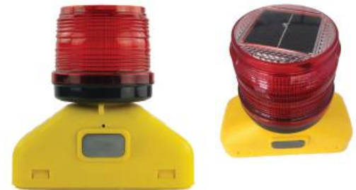
360 Degree - Type D Function: Steady-Flash-Close SLB-HD-4DDSU