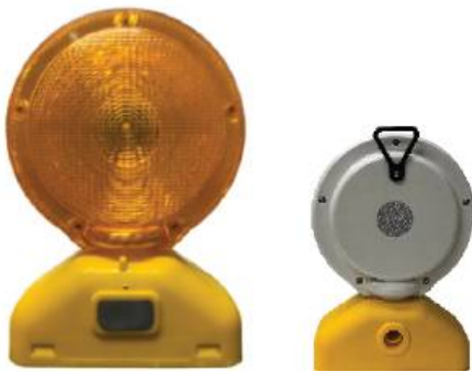
Single Side Lens - Type B Amber Lens Function: Steady-Flash-Close Requires 4 D-Cell Batteries SLB-AB-410KB