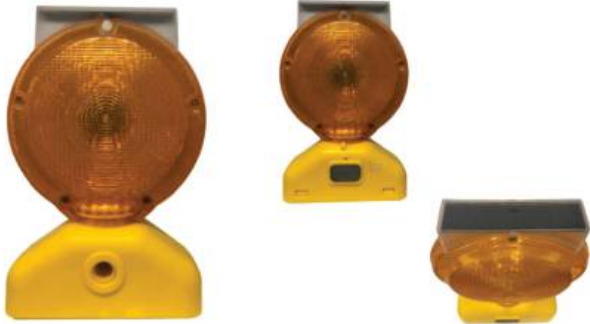
Double Side Lens - Type A/C Function: Steady-Flash-Close SLB-AB-SU410KA