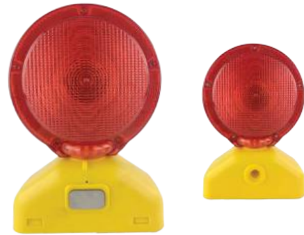
Double Side Lens - Type A/C Red Lens Function: Steady-Flash-Close Requires 4 D-Cell Batteries SLB-AB-410KR