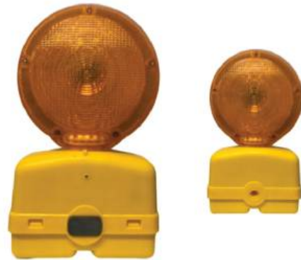
Double Side Lens - Type A/C Amber Lens Function: Steady-Flash-Close Requires 2, 6V 4R25 Batteries SLB-AB-410A