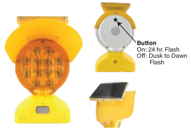
Single Side Lens - Type B Function: Steady-Flash-Close SLB-AB-SU610KA

Button On: 24 hr. Flash Off: Dusk to Dawn Flash