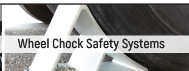
Wheel Chock Safety Systems