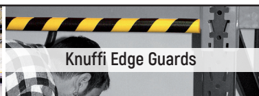
Knuffi Edge Guards