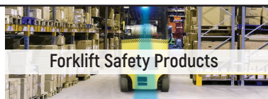
Forklift Safety Products