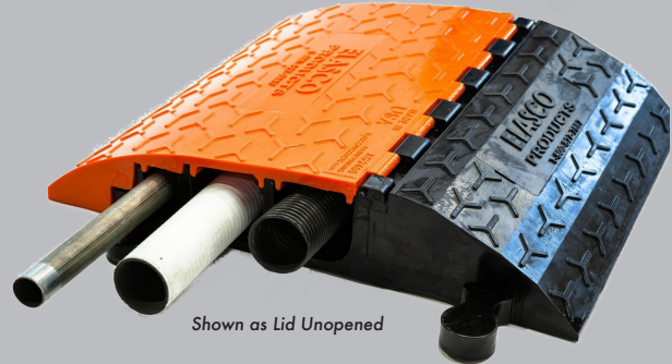
Shown as Lid Unopened