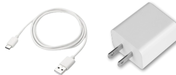
USB-C Charging Adapter & Cord