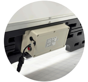
Magnetic Rechargeable Battery